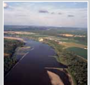
Images, Top to Bottom Phase I Site Investigation for Salt Marsh Restoration Study

Canal Reclamation at Jean Lafitte National Historical Park and Preserve, Barataria Preserve Unit