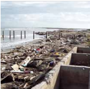
Above Aftermath of Hurricane Katrina prompting LBG's involvement in recovery efforts.

A few of our highest profile disaster response and/or recovery program support assignments include the Exxon oil spill in the Arthur Kill (NY/NJ) estuary, multiple hurricane/flood responses, the Mount Pinatubo Volcano eruptions (multiple) on the island of Luzon in the Philippines, the Haiti earthquake, and the 2001 World Trade Center, and anthrax terrorist attacks.