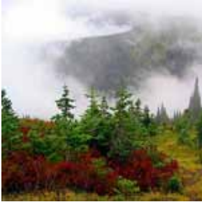
Above: Northwest Forest Bogdan Migulski

Mr. Eastin has valued the entire non-income producing natural resource inventory of a Northwest state in connection with the development of its Asset Stewardship Plan. Significant timber assets of the state were valued on an income-stream basis. He then directed the valuation of the remaining non-market assets of the state. These included forest and nature preserves, fishing, hunting, and outdoor recreation opportunities. Aquatic resources—including marketed assets such as boat launching facilities and commercial clam beds—were valued, as were their non-market components such as wetlands and streams.