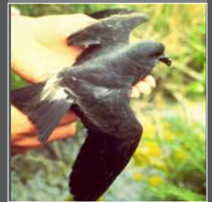
Above: Wildlife injury assessment.

An Eastern state retained Mr. Keith Eastin, Vice President at LBG, to assist in structuring a program to foster non-litigated settlements of natural resource damage claims. Also, he has worked with a large Western state to create a geographic information system (GIS)-compatible database of its more than 1,000 hazardous waste sites for purposes of identifying the state's natural resource damage problem areas and structuring a program for their settlement.