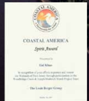
Above: Coastal America SPIRIT AWARD for efforts on the Woodbridge Creek and Joseph Medwick Marsh Project Teams

The potential impact to tidal, estuarine marshes from the oil spill in the Gulf could be extensive. A calculated and quantitative approach to restoration and mitigation for oil spill damages will be needed to restore ecosystem functions, services, and benefits to the public. An additional consideration is the current and extensive ongoing federal, state, and local planning and coastal restoration efforts. For over two decades, the USACE and the state of Louisiana have planned the Louisiana Coastal Areas Study. Phase one of the study has been authorized. The Louisiana Office of Coastal Protection and Restoration (OCPR) was established by the Governor of Louisiana in 2008. A number of agencies (USACE, NOAA, NRCS, USFWS, USEPA) coordinate, plan and implement projects in concert with parishes and variety of stakeholders.